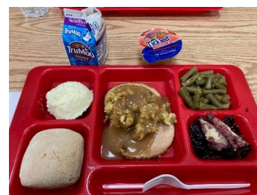
Davidson County Schools