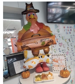
Currituck County Schools