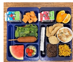
Union County Public Schools