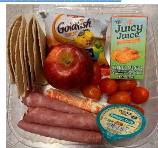
Cherokee County Schools