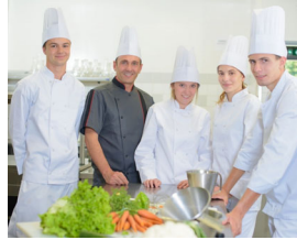
NC Jr. Chef Competition