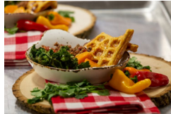
NC Jr. Chef Competition