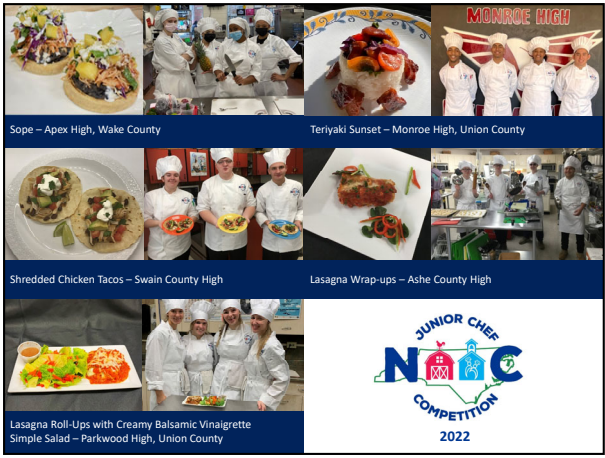
Sope – Apex High, Wake County