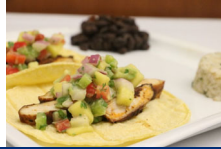
NC Jr. Chef Competition