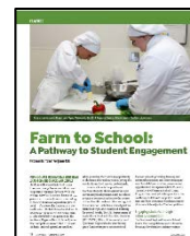
Apex High Team at 2019 Southeast Jr. Chef Competition