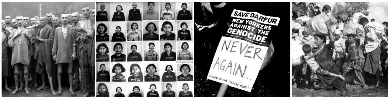
Holocaust survivors, 1945