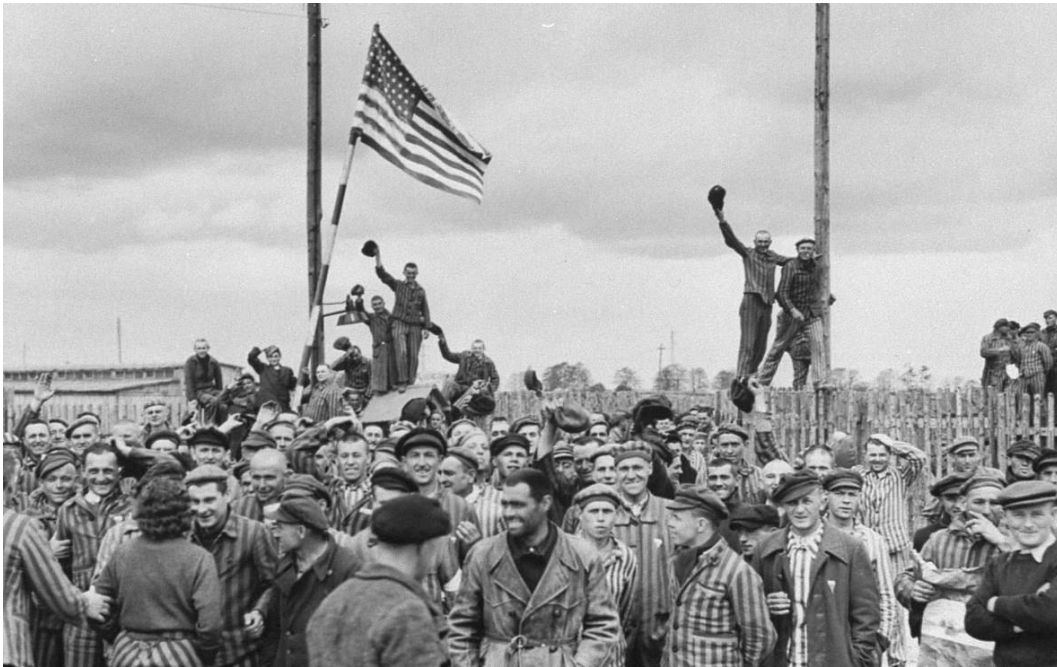
Inmates greet U.S. Seventh Army troops upon their arrival at the Allach concentration camp, Germany, April 30, 1945.