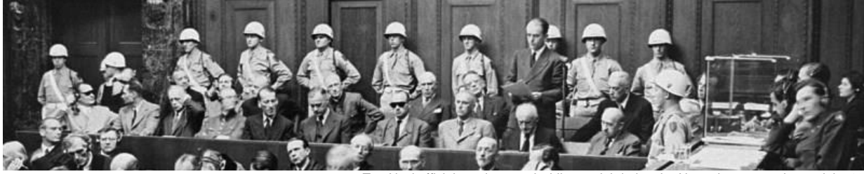
Top Nazi officials under guard while on trial during the Nuremberg war crimes trials, 1946