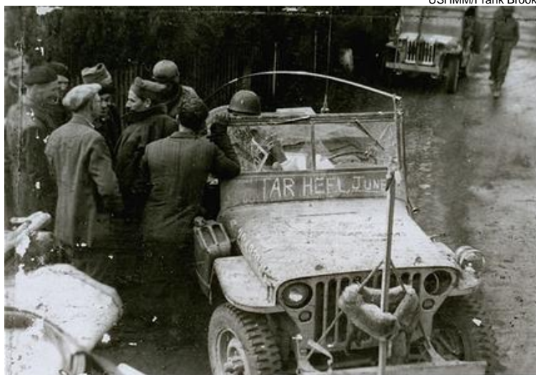
Survivors speak to an American liberator (perhaps from North Carolina), Mauthausen concentration camp, Austria, May 1945.