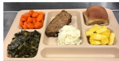
Buncombe County Schools