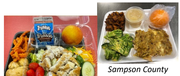
Greene County Schools