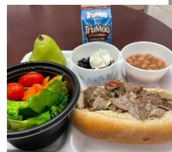
Wilson County Schools