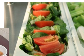
Burke County Public Schools