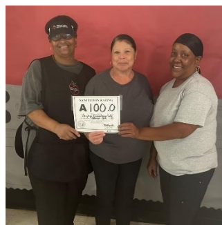
Vaughan Elementary - Warren County Schools

A number of North Carolina schools are starting off the year with a perfect 100 sanitation score. What an amazing accomplishment! We are excited to hear this good news and appreciate the hard work and dedication of our School Nutrition heroes across the state to the nutrition, health, safety, and well-being of our students. Thanks for all you do each day to nourish students' bodies, minds, and souls!