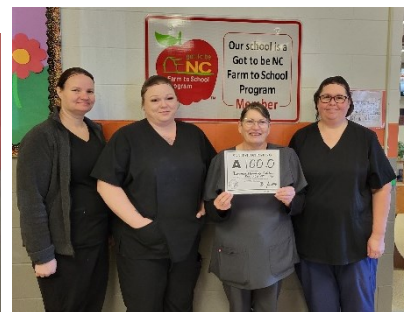
Rosman Elementary - Transylvania County Schools