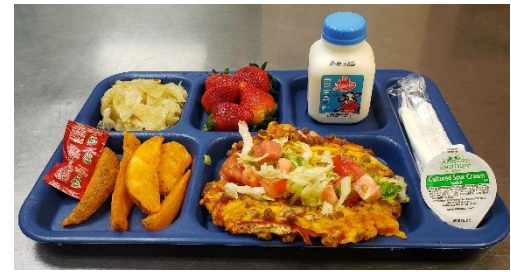
Beaufort County Schools