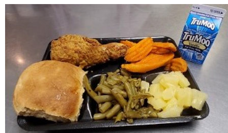
Wilkes County Schools