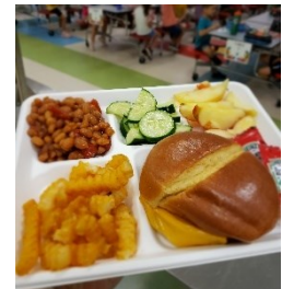
Wake County Public Schools