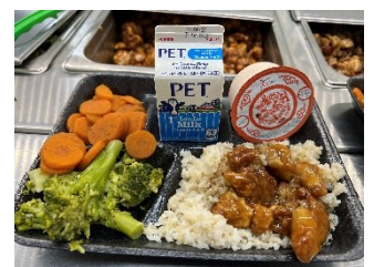
Johnston County Schools