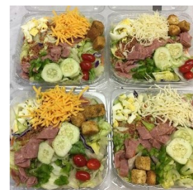
Franklin County Schools