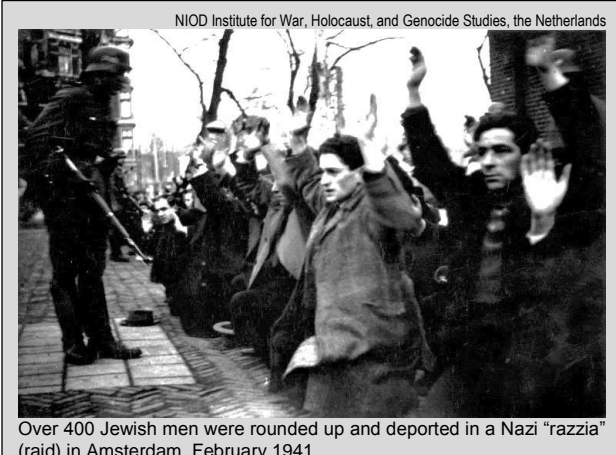
(raid) in Amsterdam, February 1941.

Holland was such a topsy-turvy place, you know, after the bombing of Rotterdam, between the 10<sup>th</sup> and the 14<sup>th</sup> of May in 1940. There were a lot of non-Jewish people also displaced, because they had been bombed out of their houses. So you had people looking for shelter, and Jewish people on the run looking for hiding places. And Germans coming and making house searches. Where I lived they were constantly searching. I was Jewish, and I was putting everyone at terrible risk, and their sons were conscript material [eligible for the military draft]—they were the age when the Germans would have taken them.