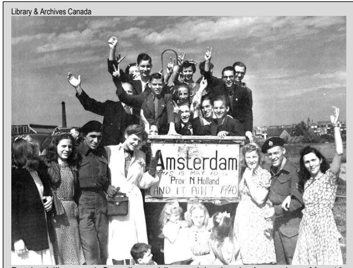
Dutch civilians and Canadian soldiers celebrating in Amsterdam, May 10, 1945, two days after the Germans surrendered to the Allies, ending World War II in Europe. The sign reads: "Amsterdam/Prov[ince]: N[orth] Holland. This is May 10th. And it ain't 1940." The photo was taken five years to the day after Holland was invaded by the Germans on May 10, 1940.

There were no lights, no electricity. We had to go downstairs to get water from the fire hydrant and bring it to the third floor in buckets between three and five in the afternoon—you were assigned periods where you were allowed to get water. We were pretty starved. During that time we ate from the soup kitchen. We ate flower bulbs, soup made out of flower bulbs. We ate whatever the soup kitchen came up with. You had three little pots, and one of you had to go to the soup kitchen and get it. We hadn't had any butter or fat for so long that we were freezing to death. I was always cold. This is still one of my greatest fears. I can stand hunger better than cold. It was terribly cold! There were six or seven of us in the apartment. We would all go in one bed and put everybody's blankets and mattresses on top of us and we still were cold.