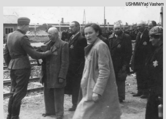
An SS physician examines an elderly Jewish man during selection, May 1944. The woman has probably been selected for slave labor