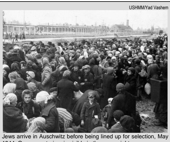
1944. One crematorium is visible in the upper right.