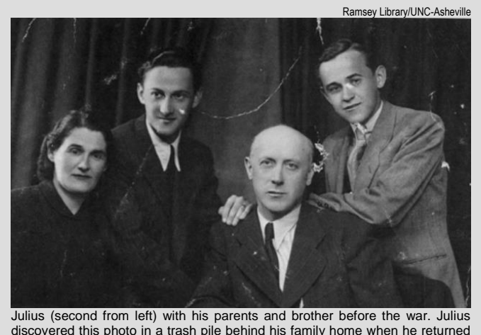
discovered this photo in a trash pile behind his family home when he returned after liberation.

I was 19 years old. I lived with my family in a small town about 100 miles south of the Polish border. A small group of young friends and I, 20 of us total, deci-