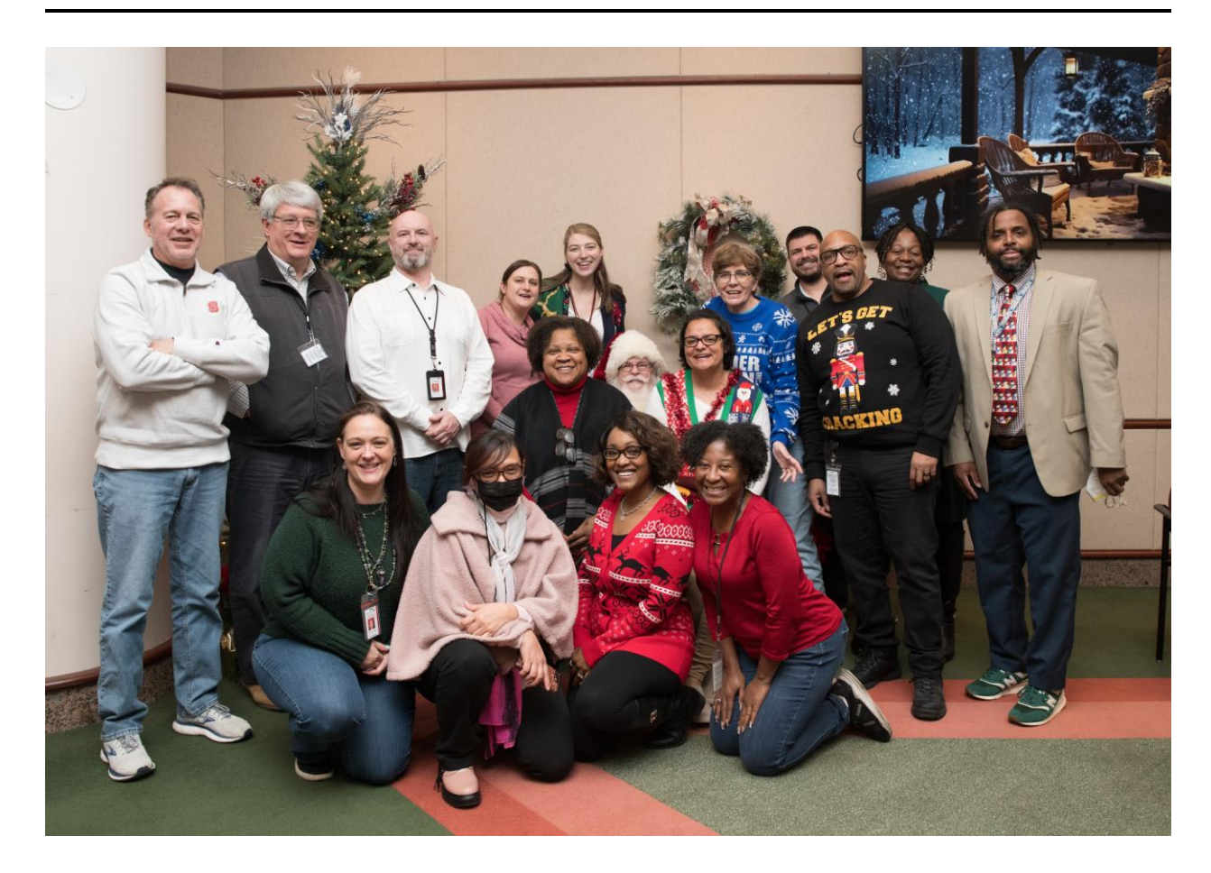
Happy Holidays from the School Business team!

The FBS website continues to be updated with information related to School Business and our ongoing operations. Please check the <u>FBS homepage</u> regularly for updates. Please review the upcoming deadlines for due dates.