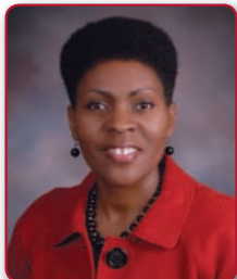
Mary McLeod West Hoke Middle School Hoke County Schools