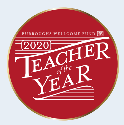
Sandhills Region Cumberland International Early College High Cumberland County Schools